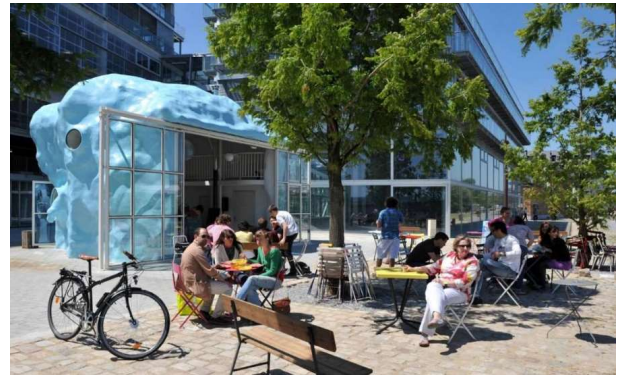
École nationale supérieure d'architecture, Nantes.