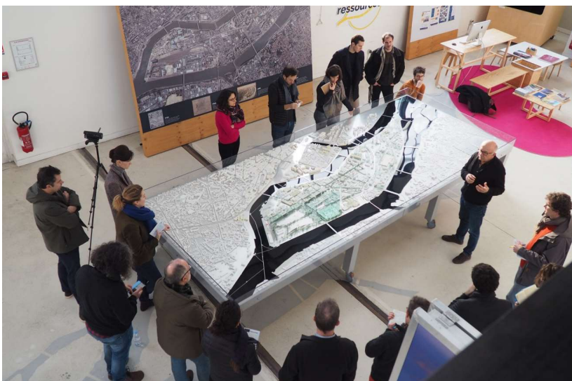
SCAENA project team