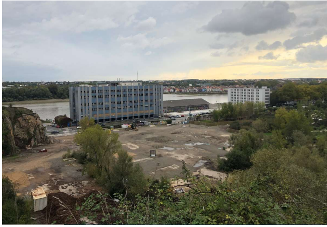
Carrière Misery Nantes